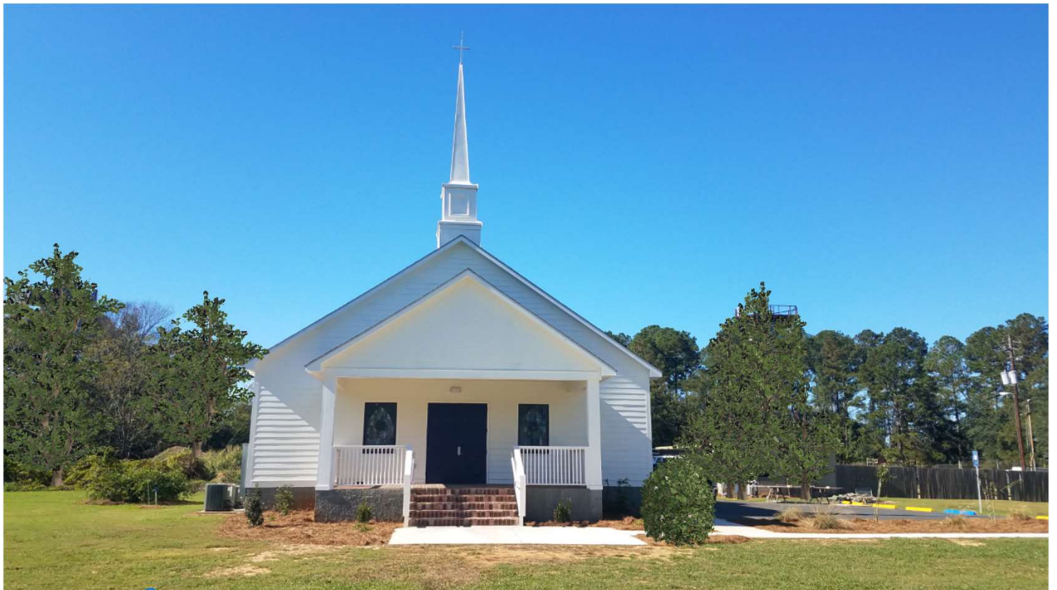
The Ginny Hayman Memorial Chapel

Non-Profit Org. U.S. Postage PAID Albany, GA Permit # 388